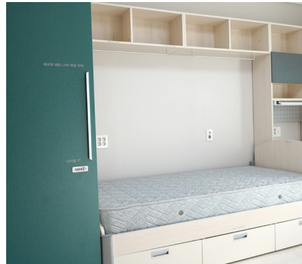
Global Campus Dorm A (2 Person Room)