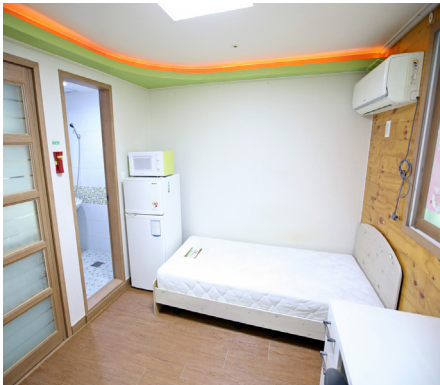
Studio Type Dormitory