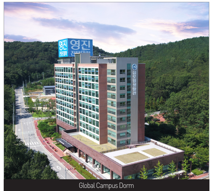
Global Campus Dorm