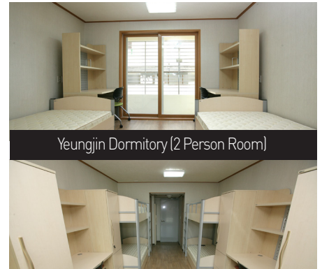
Yeungjin Dormitory (2 Person Room)